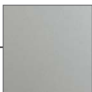
211 silver frost