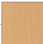
251-1 golden maple*