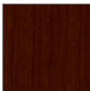
431-1 dark cherry*