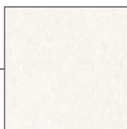
corian® in antarctica

*additional solid surface finishes available (contact customer service for a quote)