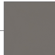
956T matte stone