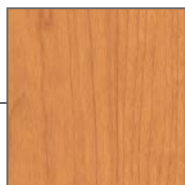
530-1 medium maple*