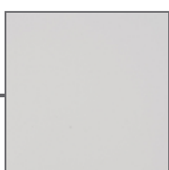
548T northern grey