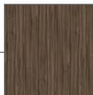
297 dark walnut*