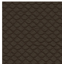
570-3410 Root Beer