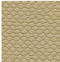
570-3445 Wild Honey