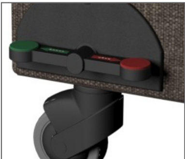
CENTRAL LOCK + STEER