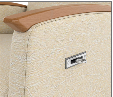
FOLEY BAG HOLDER