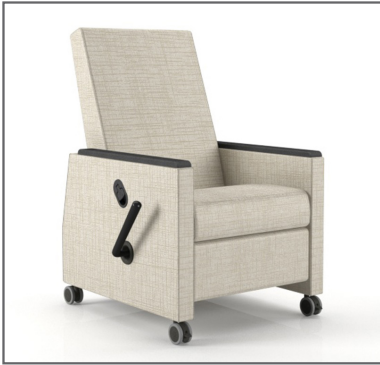
MAX | M0107