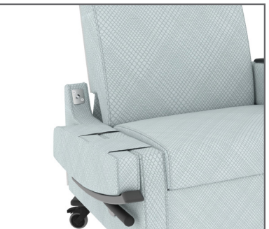
PATIENT TRANSFER ARMS FOLD DOWN