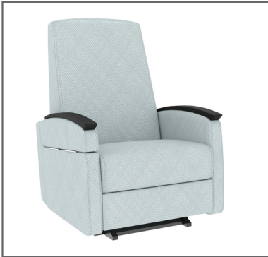
EV | E1125L