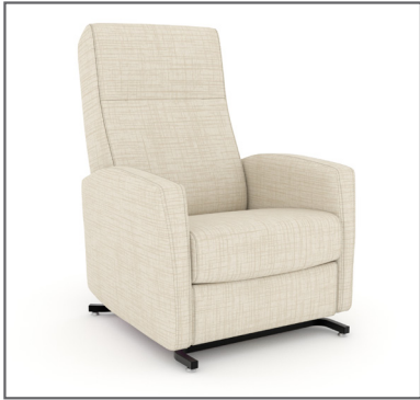
K-KOMFORT | K8P04