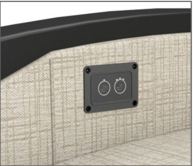
HEAT + MASSAGE