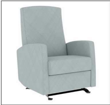
EV GLIDER | E1716