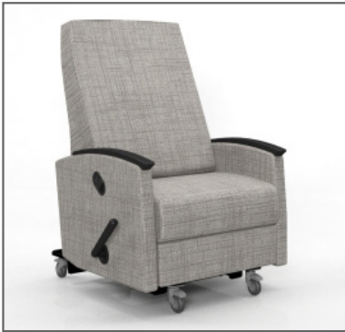
EV | E4127