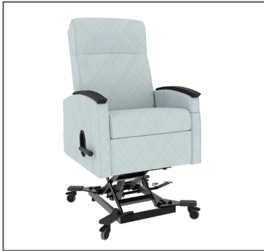
RÊMA | R7167