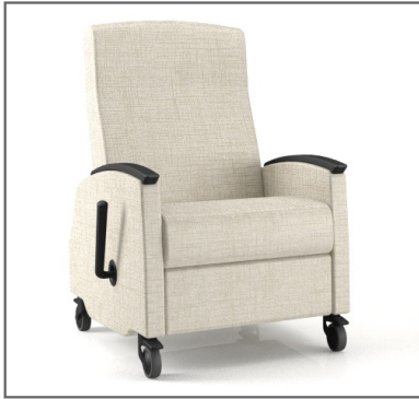
KURE | K0107