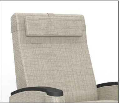
ADJUSTABLE HEAD REST PILLOW