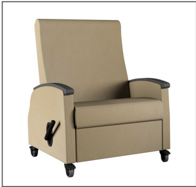
LEDA | LBC1137