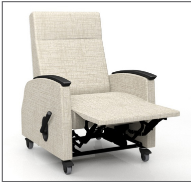
RÊMA | RC1117