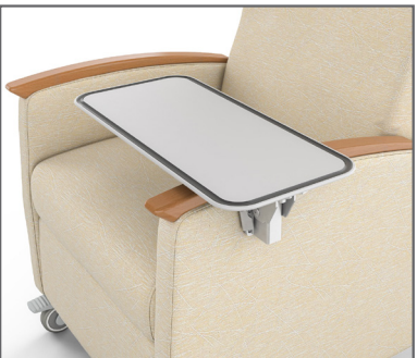
SIDE TRAY TABLE