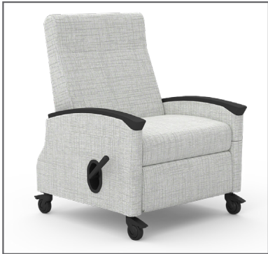
HARMONY | H5057