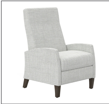
KURE | K0100