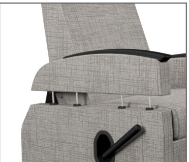
PATIENT TRANSFER ARMS REMOVABLE