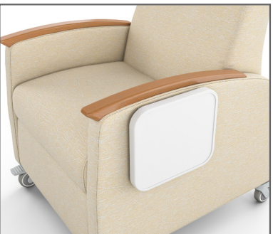
FOLDING SIDE TRAY TABLE