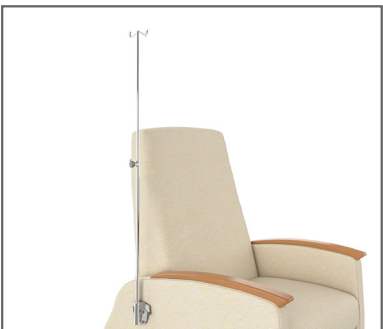
IV POLE + BRACKET