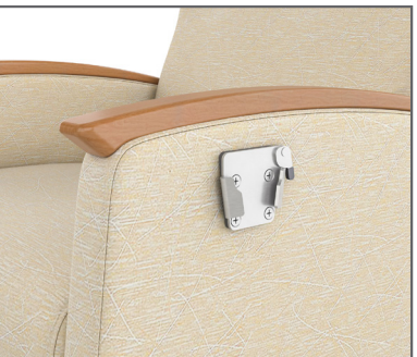
QUICK RELEASE BRACKET