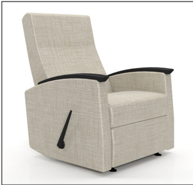
KONCERT | K1304