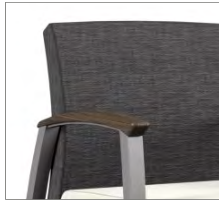
WOOD ARM CAPS