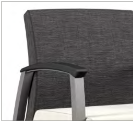
URETHANE ARM CAPS

Weight Capacity | Guest Seats {550 lbs}. Bariatric Seats {750 lbs}.