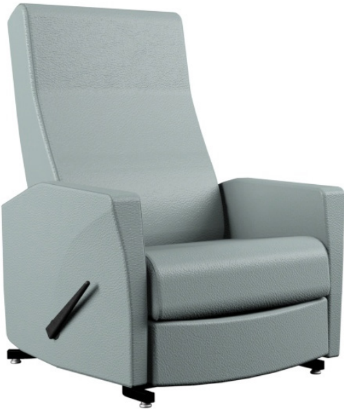
K8016 | K-Komfort Collection