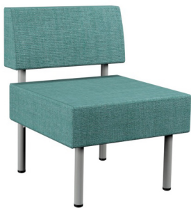
EX10N | 1 Seat Armless Chair