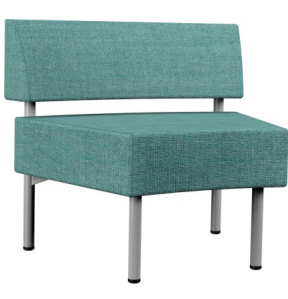
EX30IC | 30 Degree Inside Corner Chair