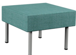
EXB2424 | 24" Wide Bench