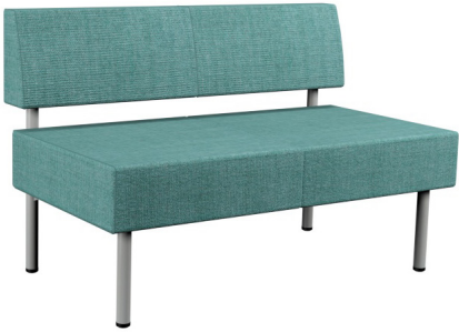
EX20N | 2 Seat Armless Chair