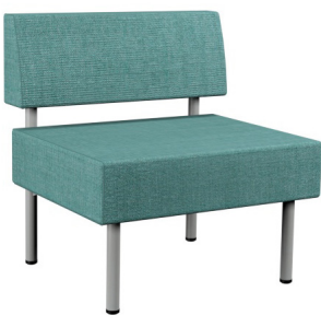
EX12N | 1 Seat Bariatric Armless Chair