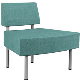
EX30OC | 30 Degree Outside Corner Chair