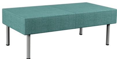
EXB2448 | 48" Wide Bench