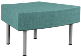
EXB30IC | 30 Degree Inside Corner Bench