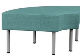
EXB90IC | 90 Degree Inside Corner Bench