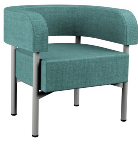
EX10C | 1 Seat Curved Chair