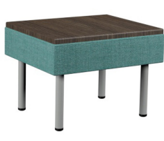
EXT10 | 24" Table with Thermofoil Top