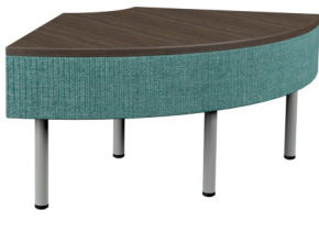
EXT90 | 90 Degree Table with Thermofoil Top