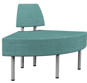
EX90OC | 90 Degree Outside Corner Chair