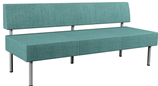
EX30N | 3 Seat Armless Chair