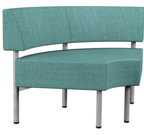
EX90IC | 90 Degree Inside Corner Chair