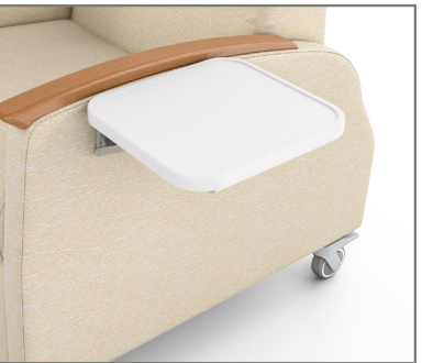
FOLDING SIDE TRAY TABLE