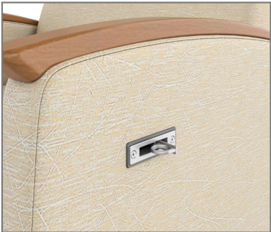
FOLEY BAG HOLDER