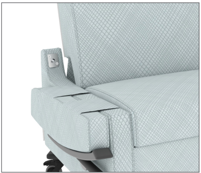
FOLD DOWN ARM