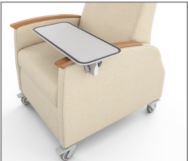
SIDE TRAY TABLE