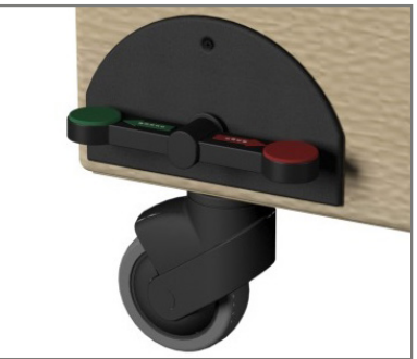
LOCK + STEER