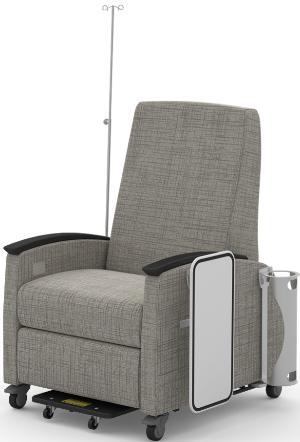
E1017 | Mobile Healthcare Recliner - Infinite Position Non-Locking Back Shown with: 042 Black Urethane Arm Caps, TSR1, OTH, FT4-1, FBH, IV, and HM

The EV and Rêma recliner collections are designed with today’s healthcare environments in mind. Sleek aesthetics, enhanced functionality, superior safety, and healing comfort are the cornerstones of our recliners.