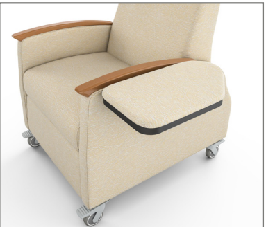
PADDED SIDE TRAY TABLE