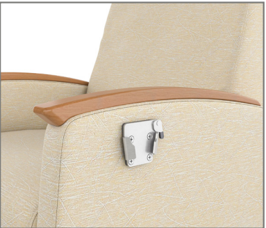
QUICK RELEASE BRACKET