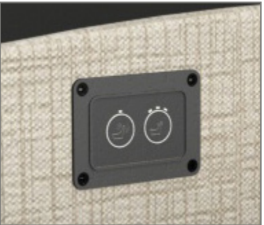
HEAT + MASSAGE