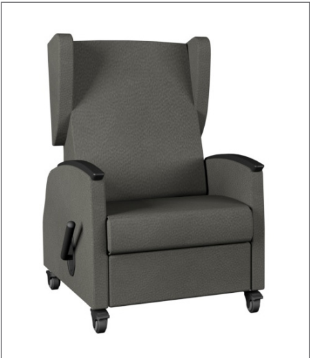
WINGBACK (EV ONLY)