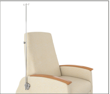
IV POLE + BRACKET