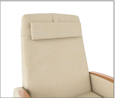
ADJUSTABLE HEAD REST PILLOW